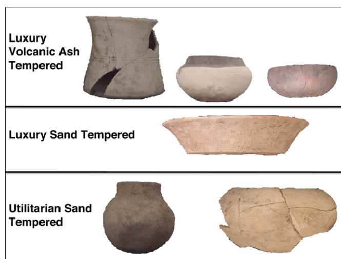
Fig. 1. Examples of complete vessels that are representative of the types of vessels within analytical categories including luxury volcanic ash tempered wares, luxury sand tempered wares, and utilitarian sand tempered wares (Photographs by Richard Brunck; pictures not to the same scale).

Twenty-four ancient ceramics from the San Andrés midden were analyzed and divided into four analytical categories based on the temper and the ware of the vessels as described in von Nagy's (2003) ceramic typology of the region. The categories are as follows: luxury volcanic ash tempered ( n=14 ), luxury sand tempered ( n=4 ), utilitarian sand tempered ( n=4 ), and an "other" category ( n=2 ) (Fig. 1). These categories also reflected differences in function based on their archaeological contexts across the region and on different amounts of labor that went into their construction (von Nagy, 2003). Luxury wares are those ceramics that were primarily used for ceremonial functions and serving foods and