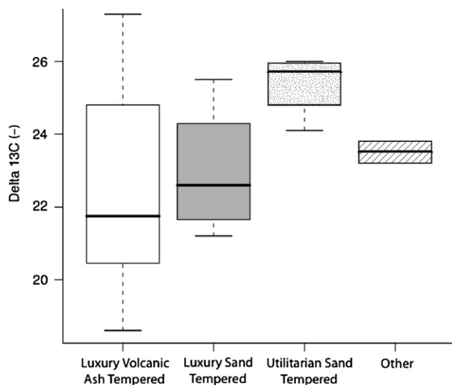
Fig. 2. Boxplot showing the average and distribution of \delta^{13}\text{C} values of absorbed organic residues in the analyzed ceramic samples. The results are organized by ceramic category. The luxury volcanic-ash-tempered and luxury sand-tempered ceramics have a \delta^{13}\text{C} closer to the -13\text{‰} that is the average value for C4 plants such as maize. These results show that maize was used in higher proportions in the luxury wares than in the utilitarian ones.